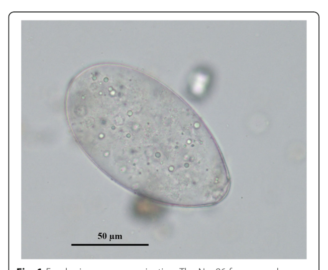
Fig. 1 Fecal microscopy examination. The No. 86 feces sample was treated by standard sedimentation method Microscopic observation multiple was \times 400. The width of the egg is 68.885 µm and the length is 124.51 µm. Scale bars: 50 µm

The Dafeng Elk National Natural Reserve is in Jiangsu province, with a warm and pleasant climate and abundant water source, and the environment provides