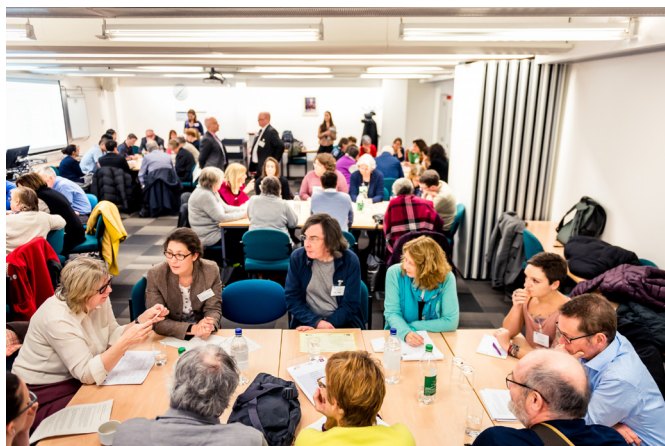
Figure 2 The Dragons’ Den session under way, showing the layout of the room used.

As epidemiologists, we try not to forget that each data point represents a person, but we need to re-examine whether we are asking the right questions of the