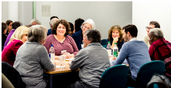
Figure 1 In the ‘Dragons’ Den’.

learnt, to help other researchers capitalise on the involvement of patients.