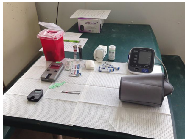
Figure 1 Screening station.

On the initial visit, all participants filled out a basic demographic questionnaire that also included information about their cardiovascular medical history (hypertension, diabetes and hyperlipidaemia), smoking status, level of