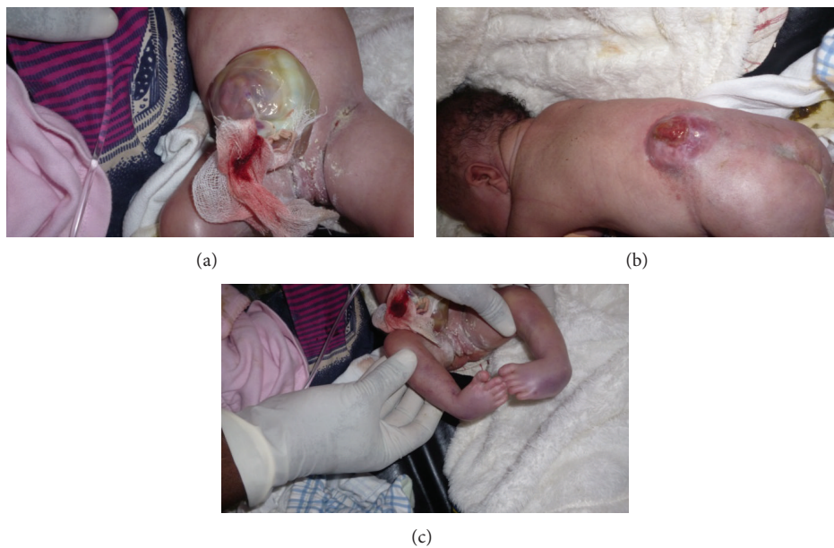
FIGURE 2: Other features: note (a) exomphalos, (b) meningocele, and (c) bilateral club feet.