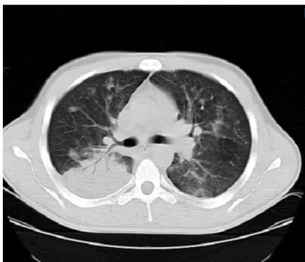
Fig. 2. Pulmonary bilateral ground glass appearance.

At his second day of hospitalization, the patient was admitted to ICU owing to decline in respiration. Supplementary data are summarized in Table 1.