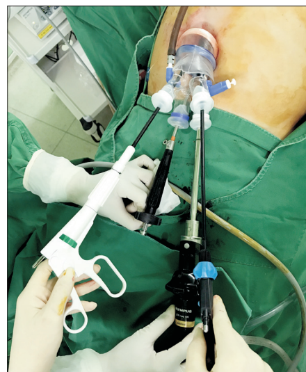
Fig. 4. Commercial glove port for commercially modified Konyang Standard Method.