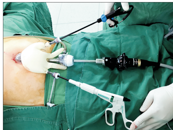
Fig. 1. Hand-made working port for Konyang Standard Method.

The operator uses the grasper in the right hand for cephalad traction on the fundus of the gallbladder in a supero-lateral direction. Then, the cystic duct and porta hepatis are exposed (gallbladder traction). If the cystic duct and porta hepatis are identified, the operator needs to establish the critical view of safety. The operator uses the grasper in the right hand to push the infundibulum of the gallbladder infero-laterally, and the dissector and suction-hook Bovie in the left hand to dissect the hepatocystic triangle boundary. If the gallbladder neck is