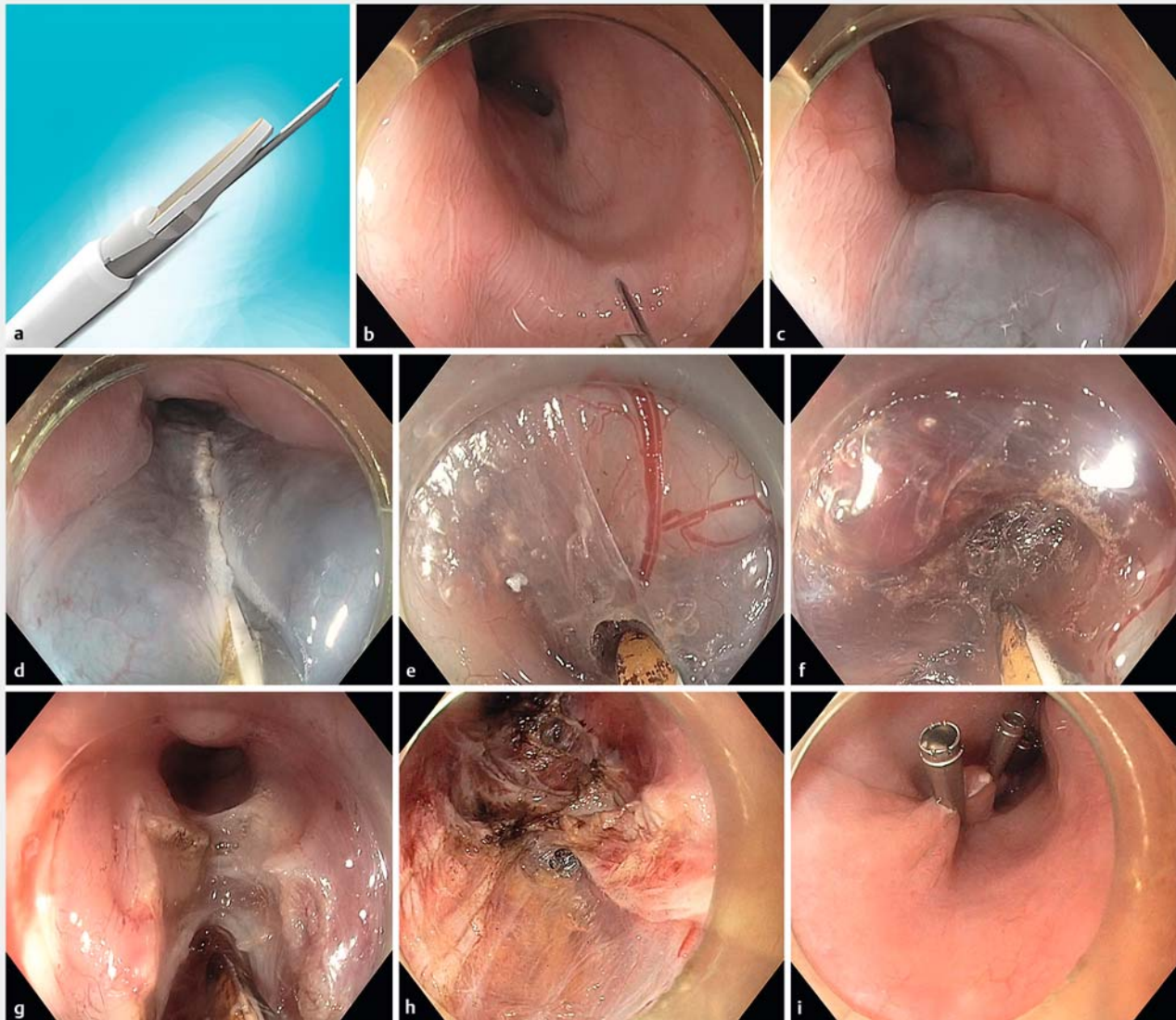
► Fig. 1 a Speedboat RS2 Endoscopic device with attached blade, insulated hull, and needle. b Retractable integrated needle being used for submucosal injection. c Instillation of saline underneath mucosa. d An incision being made on posterior wall of the esophagus. e Submucosal tunnel being created using Speedboat-RS2. f Lateral and forward cutting of circular and longitudinal muscle fibers of the esophagus using the curved tip and flat edges of the blade. g Lateral and forward cutting of circular and longitudinal muscle fibers of the esophagus using the curved tip and flat edges of the blade. h Lateral and forward cutting of circular and longitudinal muscle fibers of the esophagus using the curved tip and flat edges of the blade. i Mucosal incision closed with standard hemoclips.

ious minimally invasive surgical procedures [11]. While performing the procedure, we used a 2TH endoscope, since the Speedboat-RS2 needs a wider therapeutic channel (3.7 mm), however, the procedure can even be performed with a 1TH endoscope from Olympus. The latter was currently unavailable to us, hence we proceeded with the former. We did not encounter any flexibility issues when using a larger scope and POEM was performed in both patients meticulously and with ease.