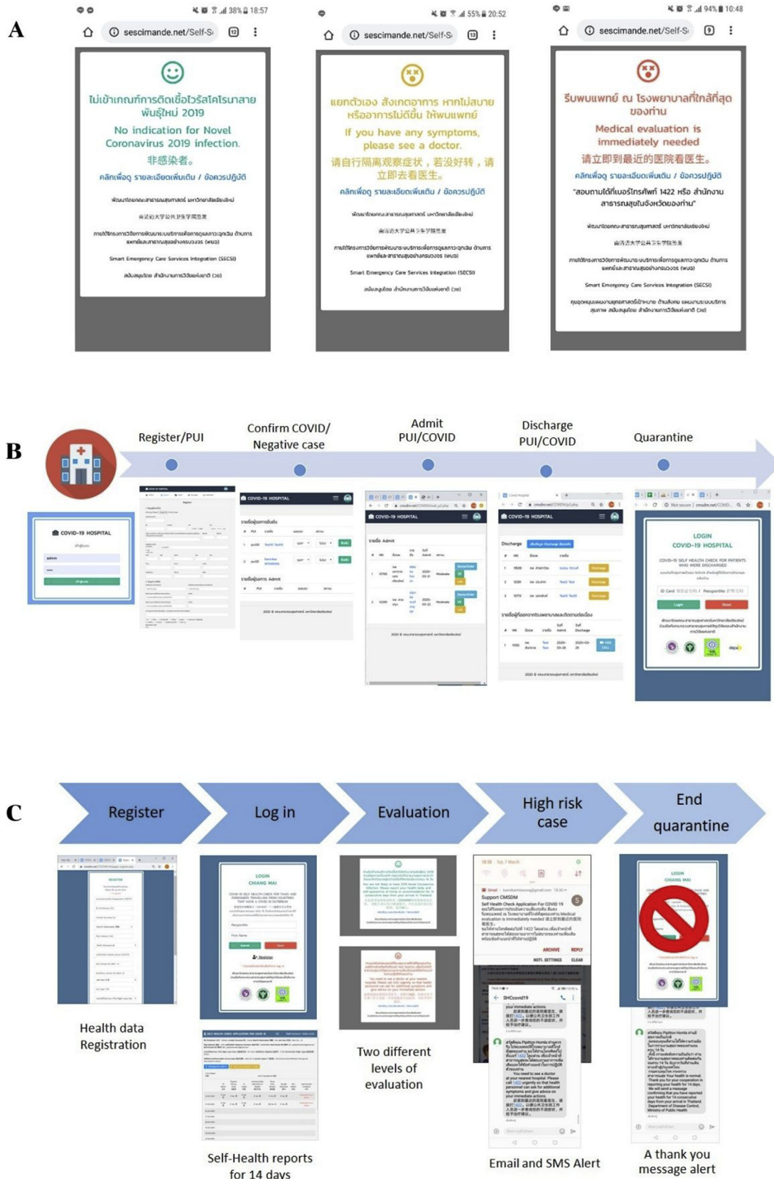
Fig. 2. Three application technologies: (A) Three levels for Self-Screening evaluation, (B) Real time Self-Health Check application data monitoring for travel follow-up, quarantine, and lockdown, Thailand, March 3, 2020, (C) Chiang Mai COVID-19 Hospital Information System implementation, Chiang Mai, Thailand, March 21, 2020.