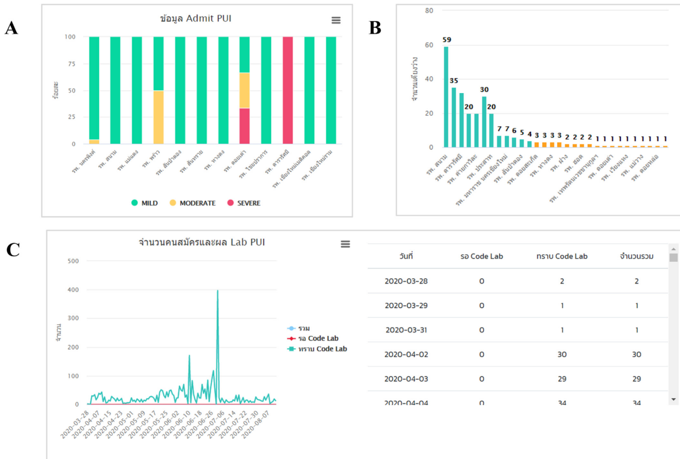
Fig. 3. CMC-19 dashboard for Decision-making: (A) Patient Under Investigation patients in each hospital, which are represented by three level; mild, moderate and severe, (B) Bed management for COVID-19 patients admitted within 51 hospitals, (C) Lab results monitoring.

laboratory results confirmed a positive result for COVID-19, patients were referred to one of the 13 network hospitals assigned for COVID-19 treatment in Chiang Mai. The advantage of the system was that all the hospitals were able to manage data within one platform, including severity of patients (mild, moderate, severe), laboratory results, drug prescription, blood test, hospital bed management or referral to another hospital. History of each patient was checked via this application platform. Administrators of each hospital or provincial health authorities were able to view the information from a dashboard about the number of COVID-19 patients, number of suspected cases who were waiting for laboratory results, their names, their symptoms, and trends of COVID-19 situations. Administrators at different levels of responsibility were allowed different rights to access in order to safeguard the data and privacy of the patients.