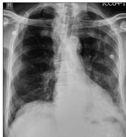
Figure 2: Chest radiograph done 48 h after decongestive therapy shows resolution of the opacities

Unilateral oedema with ipsilateral pathology has been reported with prolonged lateral decubitus position, [6] rapid thoracentesis, [7] after acute upper airway obstruction, [8]