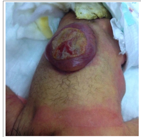
Figure 3: Lesion on the lumbar skin due to neuromuscular disorder.

perinatal mortality and morbidity, accounts for 3-4% of the deliveries [5]. Additionally, fetal anomalies increase the incidence of injuries significantly. Most of them can be managed with simple interventions, however, on rare occasions, they can be serious and life threatening [3]. Recently, obstetricians take precautions against undesirable complications. The risk of mortality and morbidity has been significantly reduced with C/S performed by accurate techniques and gentle obstetrical maneuvers [6]. Giampiero et al. defined some rules to prevent this complication as; adequate analgesia, extraction by exercising gentle traction, sufficiently wide incision of skin and uterus to allow for a smooth extraction [7]. Nevertheless, the birth trauma risks have been ongoing especially in deliveries with fetal anomalies despite these prevention efforts. The increasing incidence of the fracture due to birth trauma is considered as fetal osteoporosis due to neuromuscular disorder.