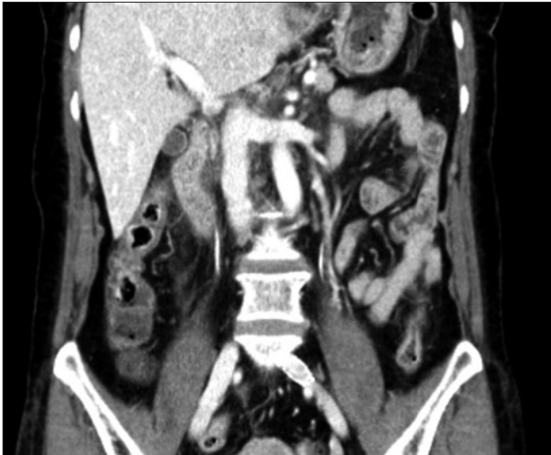
Fig. 3. Postoperative computed tomography (CT) venography. Postoperative CT venography image showing the patent inferior vena cava without stenosis.

was not required. The patient's vital signs were stable during the surgery, and perioperative transfusion was not required. Postoperative CT venography showed a good result, with no IVC stenosis (Fig. 3). The patient was discharged on postoperative day 5. Postoperatively, oral anticoagulants (rivaroxaban) were maintained for 3 months, and the patient was well without any symptoms at the 6-month follow-up.