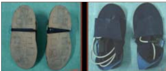
Figure 1: CDG shoes with sensors

CDG Shoes with sensors: CDG shoes are designed to measure and record the normal forces under the foot while walking. Each shoe contains 8-load sensor at the sole. Cable attached to shoes transfers the normal forces data to the ultraflex unit for recording [Figure 1].