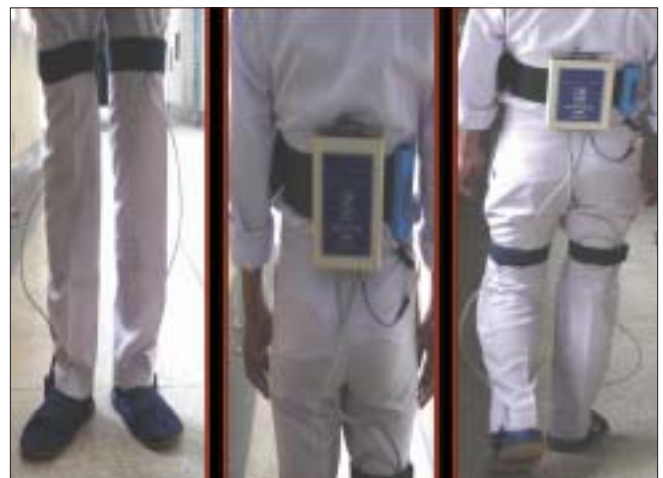
Figure 2: Method of data recording

Gait parameters and vertical ground reaction forces assessment is done by measuring the following data: