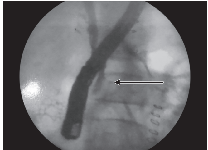
Fig. 3: Cholangiogram showing CBD discontinuity and bile extravasation

Endoscopic retrograde cholangiopancreatography revealed a leak from CBD just below the insertion of cystic duct (Figs 2 and 3), and a 7 French stent was inserted with the tip beyond the leak. The abdominal draining was stopped and removed. The patient was gradually shifted to oral diet. She was discharged after 8 days, and her stent was removed after 8 weeks. She is doing well on follow-up.