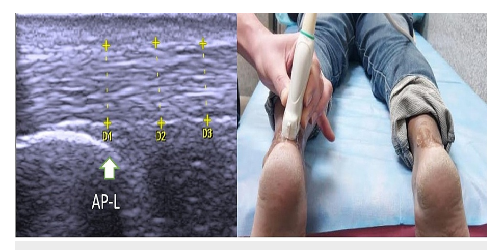
FIGURE 2: Anteroposterior thickness of Achilles tendon with longitudinal probe position (AP-L)

Ultrasonography was performed with the ultrasound machine's 6-13 MHz linear-array transducer (My Lab One, Esaote, Genoa, Italy). Ultrasound examinations were performed on all patients by a resident physiatrist under the guidance of a consultant radiologist at every visit. The anteroposterior diameter of the Achilles tendon was measured on a longitudinal view (AP-L) (Figure 2) and transverse view (AP-T) (Figure 3) with the patient lying prone and both their feet out from the margin of the bed while keeping the ankle in the neutral position. Mediolateral diameter (ML-T) (Figure 3) was taken in a transverse view in the same position. All measurements were taken at the part just proximal to the calcaneum.