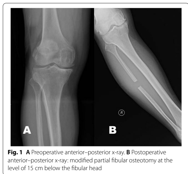
Fig. 1 A Preoperative anterior–posterior x-ray. B Postoperative anterior–posterior x-ray: modified partial fibular osteotomy at the level of 15 cm below the fibular head