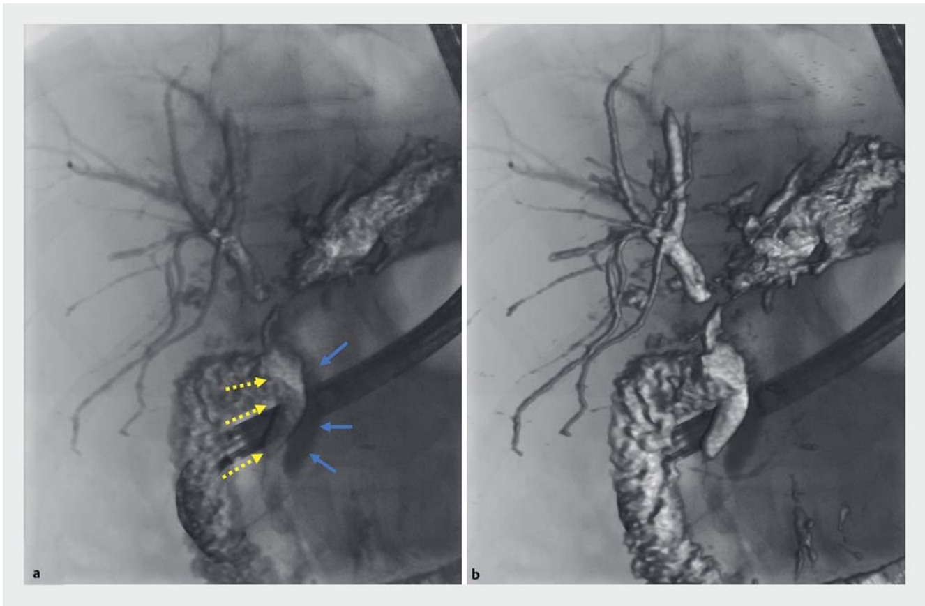
► Fig. 3 Examples of misalignment between the two image modalities. a Bimodal ERCP in a patient with a hilar stricture. The image of the extrahepatic bile duct obtained from preprocedural MRCP (dotted yellow arrows) is clearly misaligned with the image of the contrast filled extrahepatic duct obtained from conventional fluoroscopy (blue arrows). In the intrahepatic ducts, there is only minor misalignment. b Same patient as in a , but with increased overlay of an aligned and fused MRCP sequence.

biliary anatomy and c-arm positioning before intervention, during which time little additional radiation ( 1.12 \text{ Gy cm}^2 ) and no injection of contrast medium was needed. The radiation dose needed for MRI and fluoroscopic image co-registration can be considered negligible or minor compared to the total radiation dose from each procedure (mean 22.7 \text{ Gy cm}^2 ). In only 2 cases did the dose from co-registration constitute more than 15% of the total dose, with the mean being 8% contribution for all patients. However, with the visual aid of bimodal ERCP, it is likely that less radiation is needed during the rest of the procedure, possibly even resulting in a decrease in total radiation dose. From the current study, it was not possible to estimate this change in radiation dose. Image co-registration could be completed in a mean time of 12 minutes, adding minimally to total procedure time (mean 75.7 minutes).