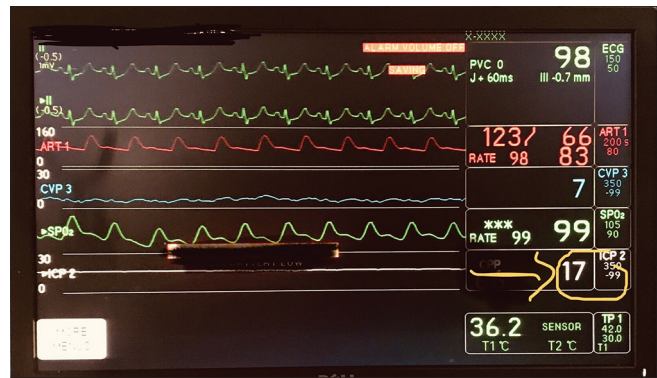
Figure 1: Cuff pressure trace and number in a sample patient (note CP = 17)

After that, TEE probe (Siemens Acuson X300) was inserted after adequate lubrication and a brief jaw thrust maneuver.