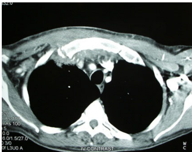
Figure 1 Computed tomography scan showing inflammatory changes behind the right sternoclavicular joint with small pockets of air behind the upper sternum.

organisms were isolated from the aspirate. Nevertheless, because there was still a degree of uncertainty, it was decided to treat the condition with prolonged jejunal feeding and antibiotics. After 2 weeks on this regime, the inflammation resolved completely and the patient was allowed oral feeding and discharged home. However, 9 days after his discharge, the patient presented with the same symptoms. Another CT scan established the diagnosis of septic arthritis showing erosive changes within the right sternoclavicular joint (Figure 3). The patient restarted a 6-week course of the same antibiotic combination but without restrictions in oral intake. Eventually, the