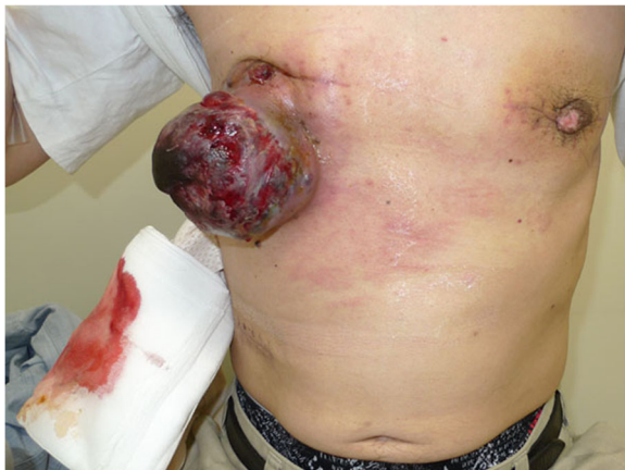
Fig. 1 A malignant wound was associated with the tumor of the right breast. Skin ulceration, bleeding, exudate, a strong odor, and infection were observed

In the case presented here, of a patient presenting with skin invasion from a pleomorphic sarcoma in the chest wall, the combination of Mohs' chemosurgery and