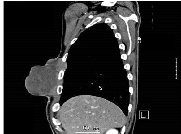
Fig. 2 Sagittal computed tomography scan showing the tumor protruding from the chest wall. The tumor also invades the intercostal area

Following three courses of chemotherapy combined with Mohs' chemosurgery, the tumor had remarkably shrunk in size (Fig. 4d). We performed wide resection of the tumor and reconstruction with a rectus abdominis