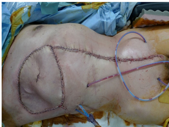
Fig. 5 Wide resection and reconstruction with a rectus abdominis musculocutaneous flap were performed

Mohs' chemosurgery has primarily been used to treat patients with skin cancer [8], head and neck cancer [9], breast cancer [10], and even genital cancer [11]. To date, there is little reported clinical evidence regarding the application of Mohs' chemosurgery for tumor reduction in sarcoma patients in the orthopedic field [12, 13]. Sarcoma tumor tissue is fragile and contains many abnormal small vessels; accordingly, sarcomas that invade the skin are often associated with bleeding. Such bleeding is detrimental to patients, and it is difficult to control. Direct suturing and electric coagulation have poor success rates in achieving hemostasis and sometimes increase bleeding further. In contrast, chemical fixation using Mohs' paste is a safe and reliable method of accomplishing hemostasis of the tumor. As well, treatment of sarcomas located on the chest wall, as in the case presented here, present a risk for pneumothorax, and therefore procedures must be performed with caution. Thus, from a safety perspective, the method of chemical fixation using Mohs' paste that is presented here provides a safe, feasible, and effective