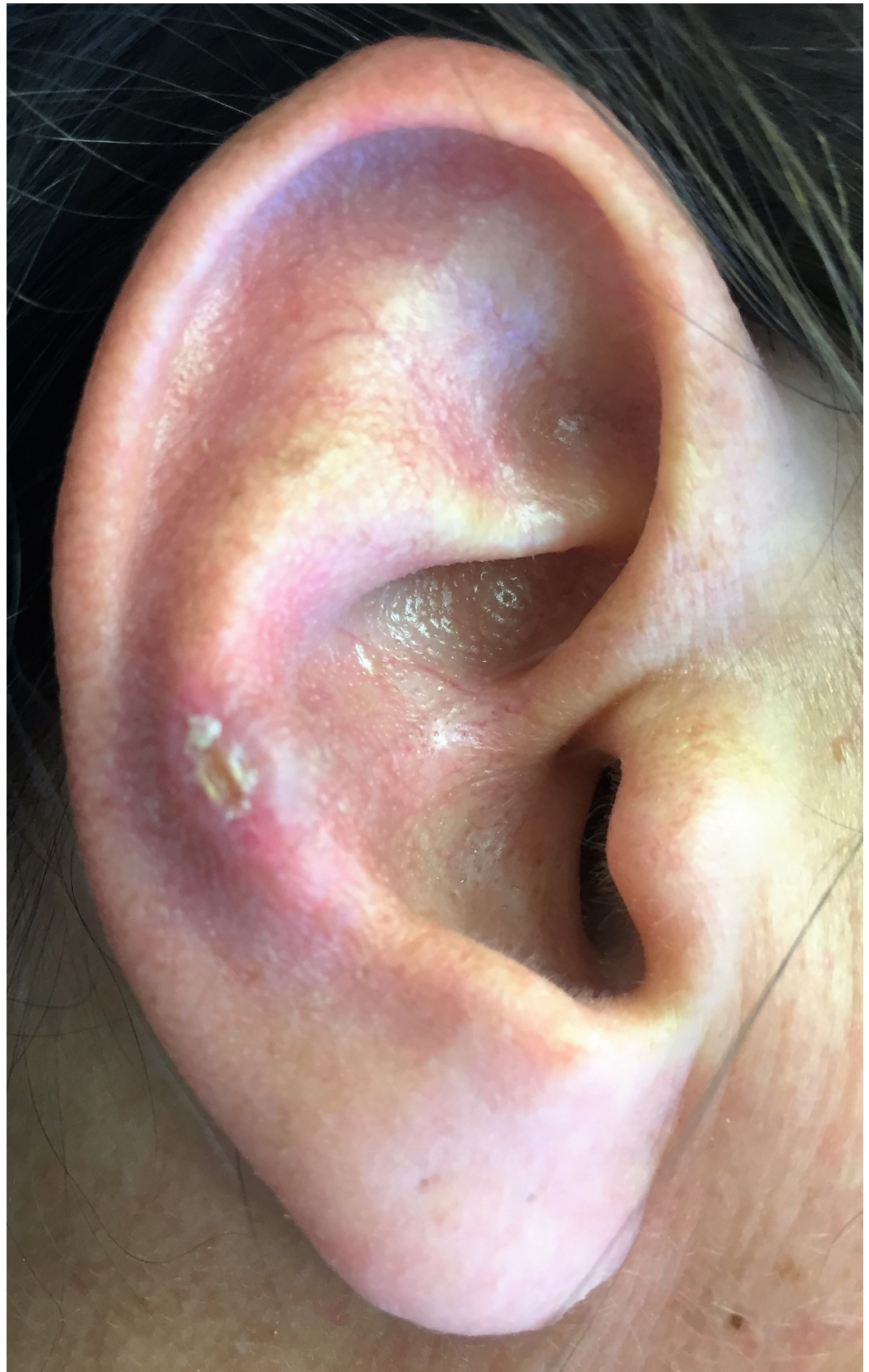
FIGURE 2: Clinical image of CNCH on the right antihelix

CNCH: chondrodermatitis nodularis chronica helicis