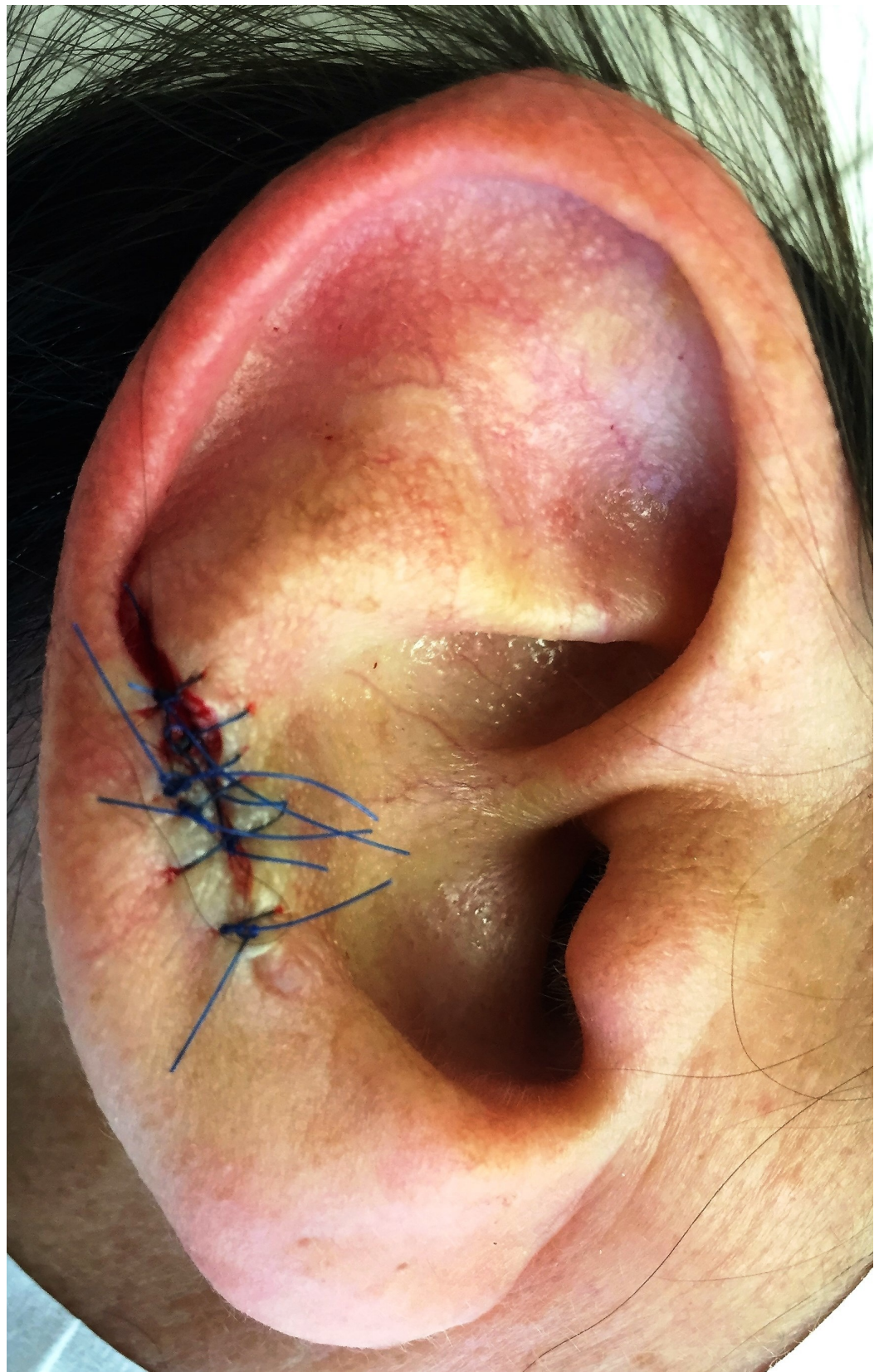
FIGURE 4: Clinical image of CNCH status post wedge resection

CNCH: chondrodermatitis nodularis chronica helicis