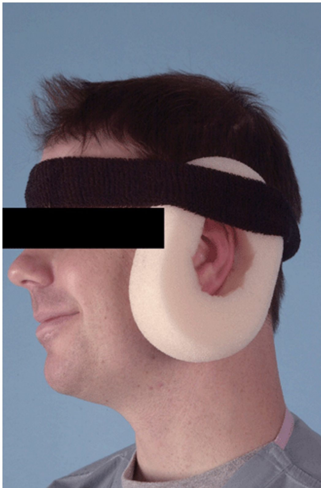
FIGURE 3: Homemade pressure-relieving device

During the study, 61 patients underwent surgical treatment. Of those, 41 (67%) were included in the study. Fifteen patients were managed with the prosthetic [23]. Of the 15 patients who underwent conservative treatment, 13 patients (87%) had resolution at the one-month follow-up and did not require surgical intervention. The authors of this study recommend the use of a