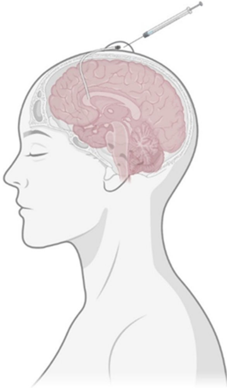
Figure 2: Schematic of Ommaya reservoir and catheter placement