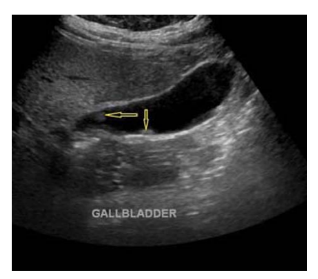
Figure 4. Ultrasound image showing multiple gallbladder polyps (yellow arrows)

in risk when compared with the Sub-Saharan Africans, which had the lowest prevalence rate of GB polyps (3.7%). Southern Asians were significantly associated with the highest increase in risk of 5.8 times when compared with Sub-Saharan Africans. Among the remaining explanatory variables, only hypertension was associated with a significant increase in the risk of having GB polyps by 48%. In addition, testing positive for HBS antigens was associated with an obvious (but insignificant) increase in risk of GB by 2.4 times. All other independent variables tested were not significantly or were significantly associated with an