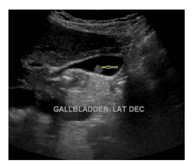
Figure 3. Ultrasound image showing a gallbladder polyp (yellow arrow)