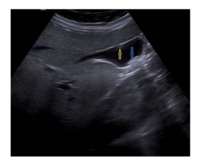
Figure 5. Ultrasound image showing gallbladder polyp (yellow arrow) and stones (blue arrow)

in risk when compared with the Sub-Saharan Africans, which had the lowest prevalence rate of GB polyps (3.7%). Southern Asians were significantly associated with the highest increase in risk of 5.8 times when compared with Sub-Saharan Africans. Among the remaining explanatory variables, only hypertension was associated with a significant increase in the risk of having GB polyps by 48%. In addition, testing positive for HBS antigens was associated with an obvious (but insignificant) increase in risk of GB by 2.4 times. All other independent variables tested were not significantly or were significantly associated with an