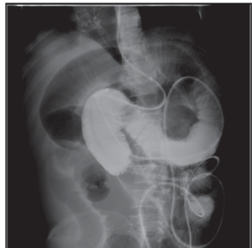
Figure 3. Small intestine at the distal end of the tube has localized stenosis, and there is expansion at distal end of the stenosed segment.