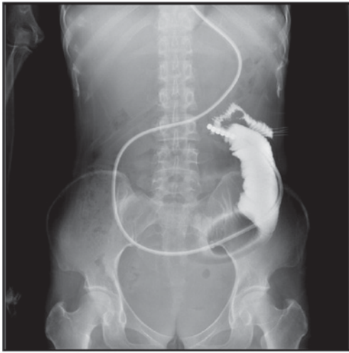
Figure 4. Opacification shows that the small intestine at the distal end of the tube has localized stenosis, and the boarder is irregular, which is considered tumor invasion.

mechanical intestinal obstruction surgery can only benefit certain patients, including those with mechanical intestinal obstruction caused by fibrosis adhesion, localized tumor solitary obstruction and chemotherapy insensitive tumor bearing patients, thus it is not appropriate to commonly choose surgical treatment.