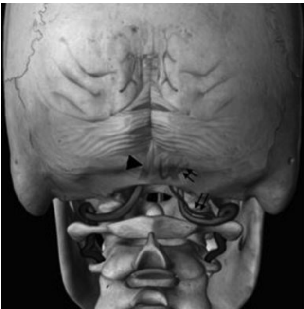
Fig. 2 Image illustrating the anatomical relationship between the upper cervical vertebrae and the vertebral arteries, which penetrate the dura between the posterior arch of C1 and the foramen magnum. The safety zone usually extends up to 8 mm on either side of the midline. The posterior inferior cerebellar artery often originates from the intracranial V4 segment (arrowhead); in this case, it originates from the C1 arch (double arrows).

is critical in all invasive procedures at the cranial cervical transition, ranging from C1-C2 cerebrospinal fluid puncture to broader surgical approaches, such as the high cervical, lateral suboccipital and extreme lateral approaches. 2,5