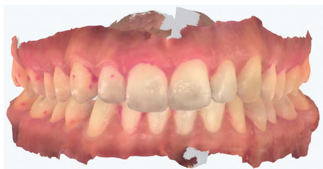
Fig. 4. Intraoral scanning image of a participant captured by an intraoral scanner (iTero Elements 2; Align Technologies, San Jose, CA, USA) following the application of a dental plaque staining agent.

Statistical analyses were conducted using SPSS version 23 (IBM Corp., Armonk, NY, USA). The Shapiro-Wilk test was employed to assess conformity to the normal distribution. Pearson correlations were computed to compare changes by group. Linear models were employed to compare dental plaque values by group, time, and method. The Tukey honestly significant difference test was used for multiple comparisons. In the qPCR analysis, the Kru-