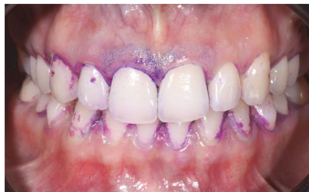
Fig. 2. Intraoral photograph of a participant captured using a professional digital camera (Canon EOS 700D; Canon Inc, Tokyo, Japan) and a macro lens (Canon EF 100 mm 1 : 2.8 L IS; Canon Inc) after the application of a dental plaque staining agent.

During the initial session, the Turesky Modified Quigley-Hein Plaque Index was clinically measured using a periodontal probe to detect any plaque accumulation. After assessing the plaque index, teeth were stained with a dental plaque staining agent (Tri Plaque ID Gel; GC Corporation). Following the staining procedure, intraoral photographs