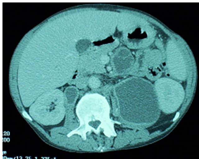
Figure 1 Abdominal CT demonstrating multiple abscessed intra-abdominal lymph nodes.