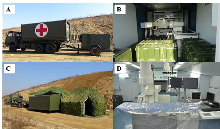
Figure 1 Different states of the novel mobile minimally invasive interventional shelter. A. transport state of the shelter; B. the interiors of the shelter; C. unfolded state of the shelter; D. working state of the shelter.

The novel mobile minimally invasive interventional shelter is a standard bilaterally-extending lab which can be carried by truck (Figure 1), transport plane, railway or cargo ship to the area of interest. The shelter is composed of a roof, a floor and two-side plates which can be extended or withdrawn by a controllable hydraulic pressure system, thus enabling the mobile unit to work on most ground conditions, fit all weather conditions, and easy and fast to transport. The cabin volume during folding (transport dimensions, Figure 1A) and unfolding (working dimensions, Figure 1C) is 6.05\text{ m} \times 2.4\text{ m} \times 2.4\text{ m} and 6.05\text{ m} \times 6.3\text{ m} \times 2.4\text{ m} , respectively. It is equipped with all necessary medical instruments for emergency interventional diagnosis and treatment, including a new medium C-arm radiographic system (maximum current: 200 mA, maximum voltage: 120 kV), an electrocardiography machine, a defibrillation monitor, an invasive blood pressure monitor, a high-pressure injector, an intra-aortic balloon pump (IABP), a portable B-mode ultrasound scanner and various modular interventional