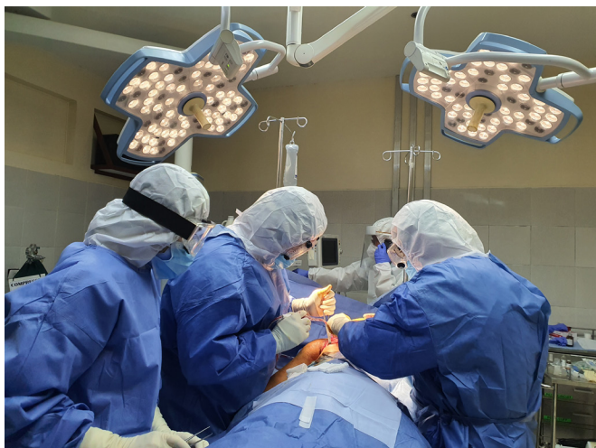
Figure 2 Forequarter amputation undertaken using enhanced personal protective equipment.

The surgery was performed in a tertiary government hospital catering to both patients with COVID-19 and patients without COVID-19. At the time, Reverse Transcriptase-PCR testing for COVID-19 was limited and not done routinely for asymptomatic patients with normal chest radiographs. A forequarter amputation was performed under general anaesthetic. All members of the surgical team wore Tyvek overalls (Dupont, USA), N95 respirators (3M, USA) and face masks in addition to the standard surgical gowns and gloves (figure 2). The operation lasted 100 min from induction to subcuticular skin closure