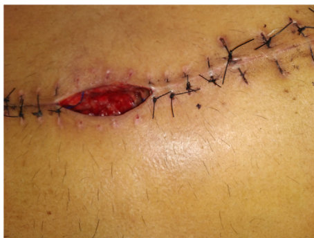
Fig. 3. Showing superficial surgical site infection on POD7.