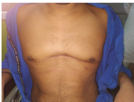
Fig. 5. After 8 months of follow-up.