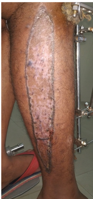
Fig. 4. Split skin grafting over fasciotomy wound on 2nd follow-up.