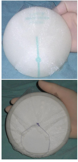
Fig. 1 Complete implant wrapping with TiLoop® Bra for subcutaneous placement

Group 2 An identical approach was carried out for the second group of patients except for the TCPM and muscular management. Once skin-fat flaps were considered adequate, a TiLoop® Bra mesh bag was adjusted around the implant but without cutting the mesh itself, in order to prevent sharp edges or spikes. Using reabsorbable sutures, a TiLoop® sheet (TiLoop® Bra, Large Extralight Sheet) was folded onto itself to create a bag which eventually functioned as a pocket for a breast implant (Fig. 1). In the case of larger implants, two TCPM sheets were used and stitched together. The TCPM bag, with the implant inside, was then placed in a prepectoral totally subcutaneous position. Medial and lateral borders were usually secured to the muscular fascia with few interrupted reabsorbable sutures. Only one JP drain was left, and no physical therapist consult was normally required.