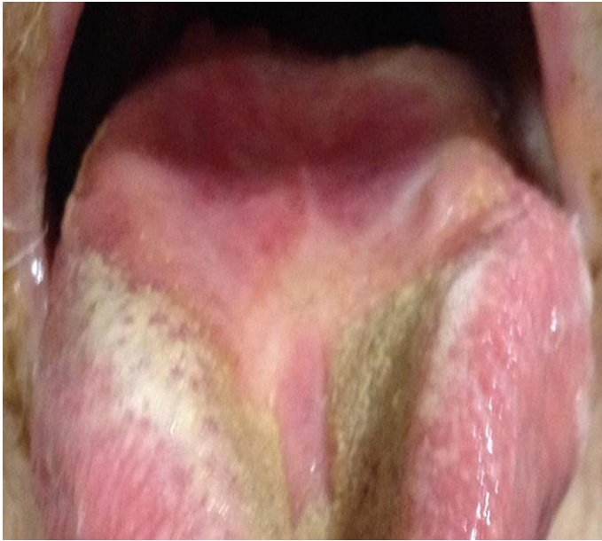
Fig. 3. Follow-up of oral lesions after 6 months of therapy with liposomal amphotericin and itraconazole.