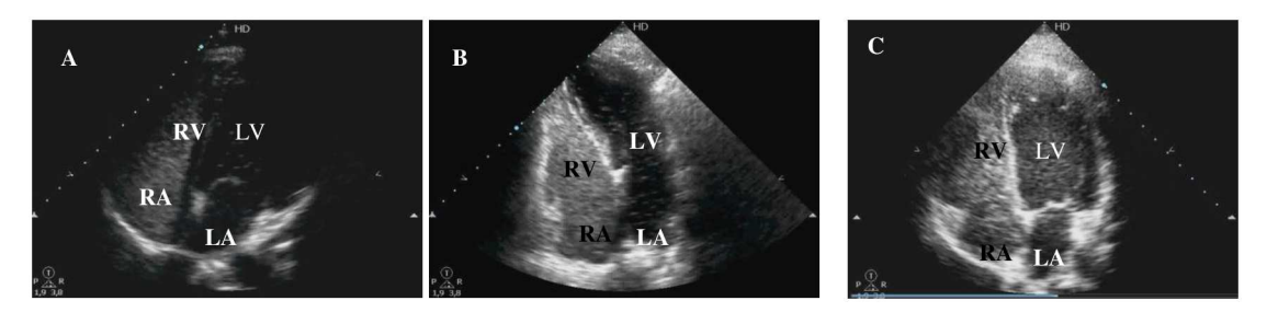
Fig 3. Transthoracic contrast echocardiography and grades of pulmonary shunt. (A) Grade 1. (B) Grade 2. (C) Grade 3. RV, right ventricle; RA, right atrium; LV, left ventricle; LA, left atrium.

The abdominal ultrasound and endoscopic findings were compared between the two subgroups of patients with grade 1 pulmonary shunts versus those with grades 2 and 3. The mean values for the longitudinal diameter of the spleen, cross-sectional diameter of the portal vein, and cross-sectional diameter of the splenic vein were similar in both subgroups. There were also no significant differences in the presence of collateral vessels and in cross-sectional portal