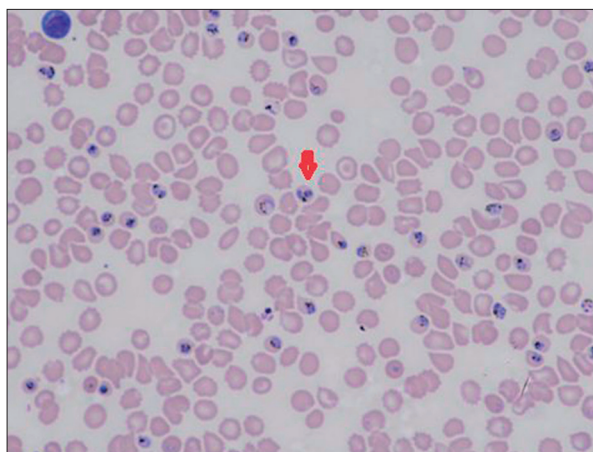
Figure 1. Peripheral blood film.

A 59-year-old Malay man was admitted to a medical intensive care unit with a 1-week history of fever and reduced urine output. Apart from being hepatitis B-positive and a previous history of cholecystitis, he had no other significant medical problems. Due to an acute hemodynamic compromise from septicemia, he was put on ventilatory support 1 day after admission. He was also started on broad spectrum empirical antibiotics (Ceftazidime and Co-amoxiclav). Renal replacement support was initiated due to acute kidney injury (urea 51.3 mmol/L, creatinine 558 micromol/L, potassium 4.9 mmol/L) and acidosis. Ultrasound of kidneys was normal and there was no proteinuria. His liver function test was normal. Blood film investigations showed red blood cells heavily infected with trophozoites and schizont-form Plasmodium knowlesi (Figure 1) and he was started on Quinine. Twelve days into his admission, he developed melena, with a significant drop in hemoglobin level. Esophago-gastro-duodenoscopy did not reveal a source of bleeding, but colonoscopy a day later showed a circumferential ulcer with irregular edges at 40 cms in the sigmoid colon and another superficial ulcer at the proximal