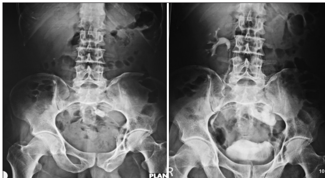
Figure 1: Kidney, ureter, bladder X-ray and intravenous pyelogram

Laparoscopy was performed in a supine position through two ports, namely, umbilical (10 mm) and left iliac fossa (5 mm). Bowel loops were mobilized and hydronephrotic left kidney visualized in the left pelvic region. Initial puncture was done from left iliac fossa under C-arm control. Dilatation was done till 16 French (Fr) using the Mini PCNL dilator, and Mini PCNL sheath was introduced. The Mini PCNL scope was inserted and calculi were seen. Approximately 2 cm brown calculi were fragmented using holmium laser. Fragmented calculi pieces were removed using 4 Fr forceps. A 16 cm 4 Fr double J (DJ) stent was placed antegradely and confirmed on the C-arm. Infant feeding tube No. 10 was kept as a nephrostomy. As the puncture in ectopic kidney was done through the upper calyx, it was easy to enter the mid and lower pole to clear all the stones. Pelvic drain was kept through the right port (14 Fr Ryle's tube) to drain peri-nephrostomy urinary leak into the peritoneum. After 48 h, nephrostomy tube was removed. Pelvic drain was removed after nephrostomy drain to check the nephrostomy site leak. The patient got discharged on postoperative day