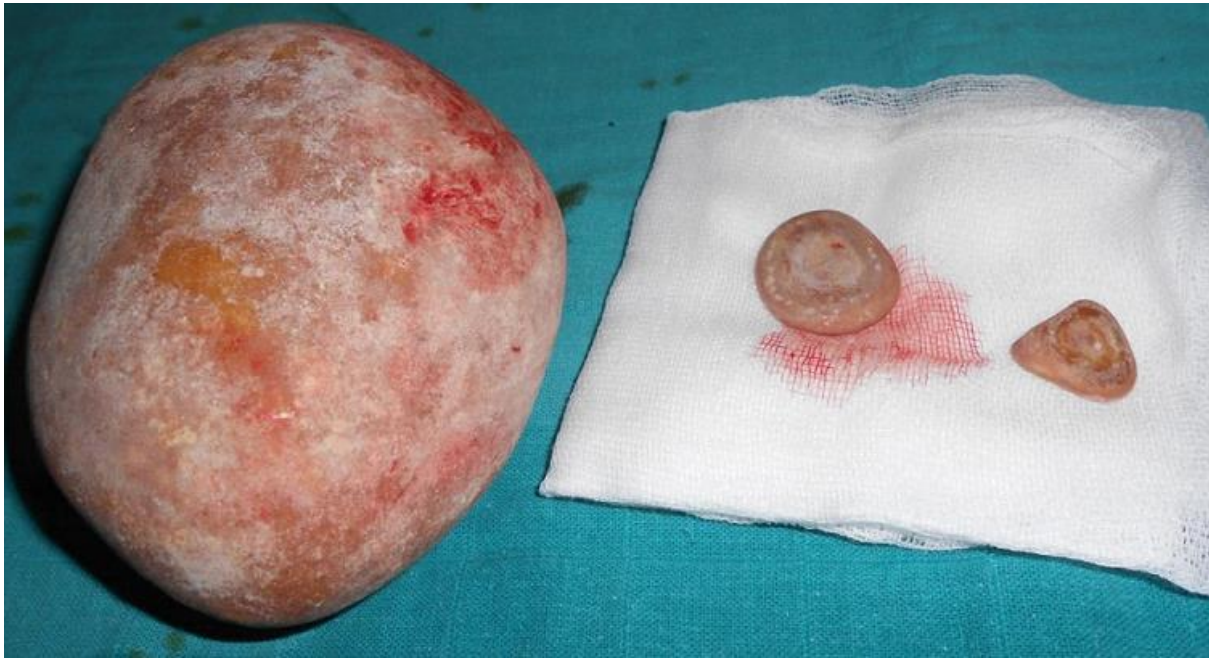
Figure 3: Giant lithiasis and two small stone after their extraction from the neo bladder