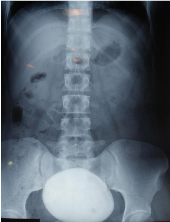
Figure 1: X-ray of urinary tract, showing a calcic opacity in the entire bladder