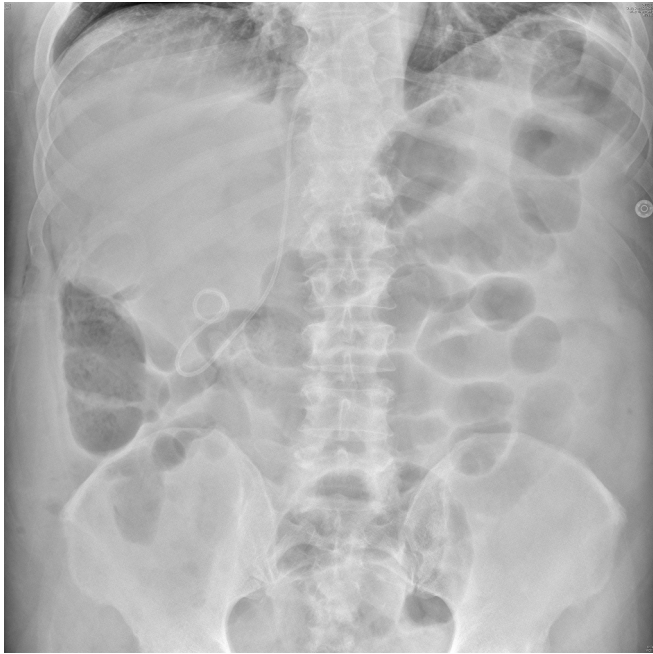
Fig. 1. Plain abdominal X-ray control (day 1 after the surgery).

sultation with cardiologists was initiated. Eight days after surgery, the patient left our department. The DJ stent was removed six weeks later.