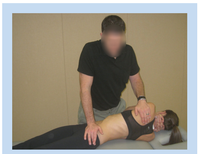
Figure 2. Supine lumbopelvic spinal manipulation technique.

Spinal manipulation has been used for centuries and remains one of the most common treatments for LBP.<sup>43</sup> As spinal manipulation can result in rapid clinical benefit in some individuals<sup>23,44</sup> and can be applied very quickly with little to no equipment, its use in athletes is especially appealing. The safety of spinal manipulation has generated a great deal of discussion and inquiry. Benign, self-limiting adverse events