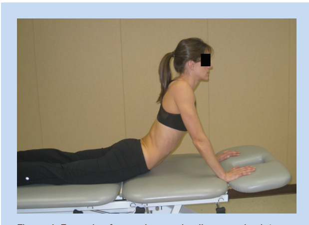
Figure 4. Example of an end-range loading exercise into extension: the prone press-up.

randomized to receive lumbar stabilization exercises. A recent systematic review of the centralization phenomenon concluded with the recommendation that centralization be routinely monitored and used to guide treatment strategies in patients with spinal pain.<sup>2</sup>