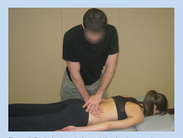
Figure 5. Posterior to anterior mobilization to promote lumbosacral extension.

The use of mechanical spinal traction for LBP and other disorders of the lumbar spine has a long history in medicine