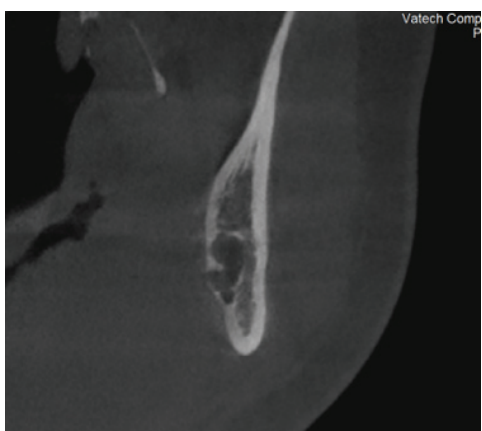
Fig. 4. Postoperative cone-beam computed tomography demonstrating the discontinuity of the upper cortical layer of the inferior alveolar canal (cross sectional view)

of increased sensitivity of the left lower central and lateral incisors to cold stimuli. On clinical examination, paresthesia was observed from the vermilion border of the lip down to the chin, but no edema or redness was observed in the affected area (Fig. 2). Intraoral examination revealed slight swelling and redness of the extraction site, and tenderness in the submandibular area. The lower anterior teeth had slight crowding, but there was no gingival edema or redness around the teeth (Fig. 3 A, B). On radiographic examination, no periapical lesion or alveolar bone loss was observed in the lower anterior teeth (Fig. 3 C). The postoperative cone-beam computed tomography revealed a slight discontinuity of upper cortical layer of the inferior alveolar canal (Fig. 4).