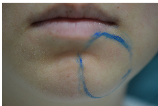
Fig. 2. Skin mapping of the affected area with abnormal sensation: the patient experienced paresthesia from the vermilion border of the lip down to the chin.

A 33-year-old woman visited the Department of