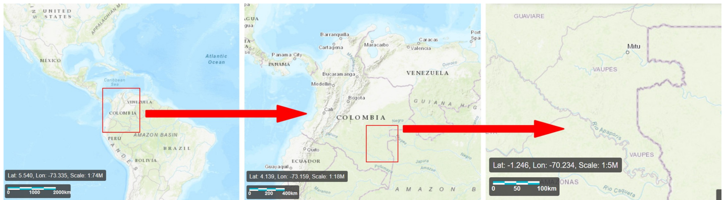
Fig 1. Geographical location of the department of Vaupés, Colombia. Figure was created for this publication using viewer from the USGS LandLook database ( https://landsatlook.usgs.gov/viewer.html ), January 2020.

https://doi.org/10.1371/journal.pone.0229297.g001