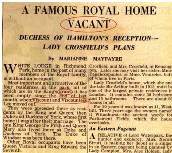
Figure 3. Newspaper passage for reading aloud. Words on which the patient made regularization errors are circled in red. [To view this figure in color, please see the online version of this Journal.]

When examined, she was noted to have an unusual personality, and to be distractible and garrulous. It was commented that “on hearing her prattle, nothing strikingly abnormal was at first noticed but mistakes were detected not expected in her stratum of society”. Examples included “recovered me” for “cured me” and “I am very physical” for “I am very healthy”. Although her speech was well articulated and grammatical, she was noted to make frequent use of circumlocutions and to have particular difficulty finding names. The patient was unable to name a pencil, torch, tape measure, or towel. There was further evidence of a “gross agnosia” for words. She brought with her extensive lists of words whose meanings she no longer knew, prepared with the assistance of a friend (Figure 2); examples include “kettle”, “sauceman”, “floor”, “fountain”, and “desert”. She was able to repeat words normally. Reading aloud from a newspaper clipping (Figure 3) was