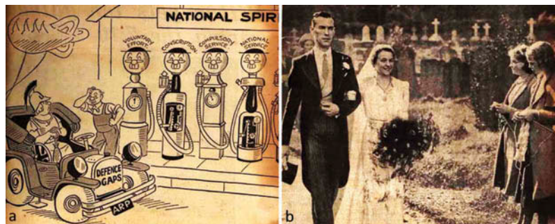
Figure 4. Pictures for assessing visual object recognition. See text. [To view this figure in color, please see the online version of this Journal.]

This patient exhibited many of the clinical features we would now regard as classical for the SD syndrome. She presented with progressive fluent aphasia manifesting as early severe anomia and loss of comprehension of words. She also demonstrated loss of vocabulary-based reading and spelling characterized by a surface dyslexia and dysgraphia but with intact grammar, phonology, and repetition. Indeed, these language features would have fulfilled current consensus diagnostic criteria for the “semantic variant” of PPA (Gorno-Tempini et al., 2011); in addition to this leading deficit of verbal semantic memory, there