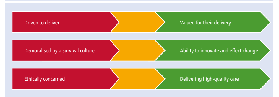
Fig. 2 Emerging contrasting themes on dentists' health and wellbeing. Note: early-career dentists and frontline NHS practitioners were generally perceived to be focused in the 'red' zone and senior colleagues in the 'green' zone

Three important contemporary themes emerged for frontline NHS practitioners, as presented in Figure 2. Participants reported either currently or previously experiencing these challenges or having witnessed others facing such challenges.