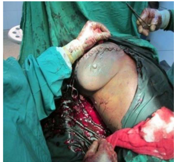
Figure 2 Breast-conserving surgery for phyllodes tumour of right breast. (Note redundant skin).

pectoralis major muscle. There were no palpable axillary lymph nodes intraoperatively and axillary dissection was not performed.