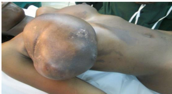
Figure 1 Giant phyllodes tumour of breast.

Our patient gave consent to a wide local excision of the tumour mass and not to mastectomy, despite being informed of the risk of local recurrence. An elliptical skin incision was made at the upper part of her breast over the biggest mass and included the previous scar. A subcutaneous flap was developed superiorly and inferiorly. A cleavage plane of the biggest tumour (>10 cm in diameter) in the upper inner quadrant was identified and the tumour excised. Using the same incision, multiple wide tumorectomies (enucleations) were performed. Two further tumours in the outer upper and lower quadrants were excised measuring about 8 cm in diameter. Six further smaller tumours within the breast tissue were removed (Figure 2). The tumours were identified on palpation by their firmer consistency and circumscribed margins as compared to normal breast tissue or the other breast. There was no infiltration to the underlying