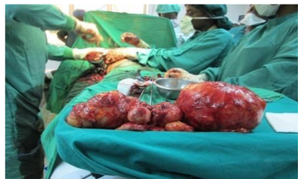
Figure 3 Operative Specimens (Phyllodes tumours).

The histopathological diagnosis of the tumour returned as a borderline phyllodes tumour with moderate pleomorphism and three to four mitoses per ten high power