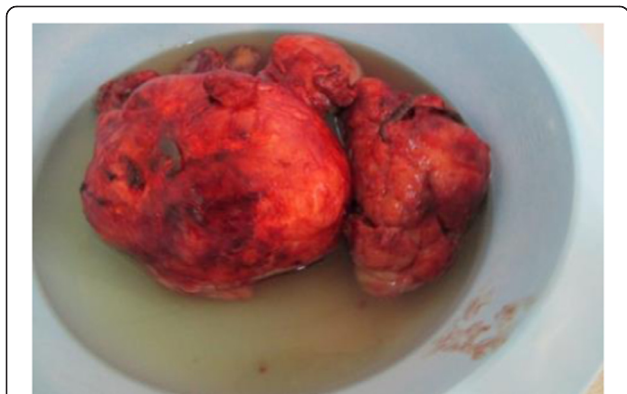
Figure 4 Fleshy appearance with cystic and necrotic areas.