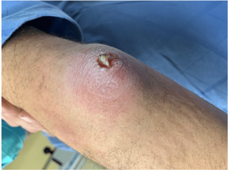
FIGURE 1: Clinical photograph of the patient's arm.

While it did not bother him much, his family wanted him to get a second opinion, so he came to the ED. Vital signs revealed a temperature of 98.6 °F, a pulse of 98 beats per minute, respiratory rate of 16 breaths per minute, a blood pressure of 155/91 mmHg, and oxygen saturation of 98% on room air. Physical examination revealed mild edema and erythema about the elbow but no calor. Plain radiographs (Figure 2) did not show any evidence of acute fracture, dislocation, or suspicious osseous lesion.