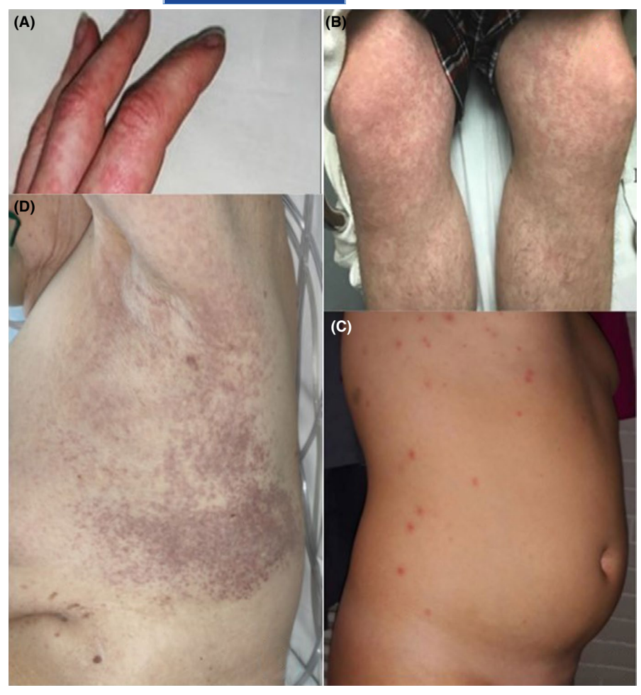
FIGURE 2 Skin manifestations similar to those in other viral infections. A, Urticaria, <sup>23</sup> B, Morbilliform maculopapular exanthem, <sup>24</sup> C, Vesiculopapular (chickenpox-like) exanthem, <sup>26</sup> D, Intertriginous purpuric rash <sup>30</sup>

one case, picture of a urticaria-like rash in a 6-month-old child with Kawasaki-like disease associated with COVID-19 infection is shown (Figure S1). <sup>29</sup> Two patients with bilateral flexural exanthems resembling systemic drug-related intertriginous exanthems (SDRIFE), one with axillary purpuric lesions associated with thrombocytopenia, have been published (Figure 2D). <sup>30</sup> A prospective study from France reported a prevalence of 5/103 (4.9%) and confirmed association of pruritic erythematous rash (n = 2) and urticaria (n = 2) with COVID-19 infections <sup>31</sup>; they additionally observed one oral herpes simplex virus type 1 reactivation. The histopathological picture of exanthematic skin lesions generally resembles that of viral exanthems. However, in individual patients, early microthrombi and an interface dermatitis with necrotic keratinocytes surrounded by lymphocytes have been reported. <sup>32</sup>