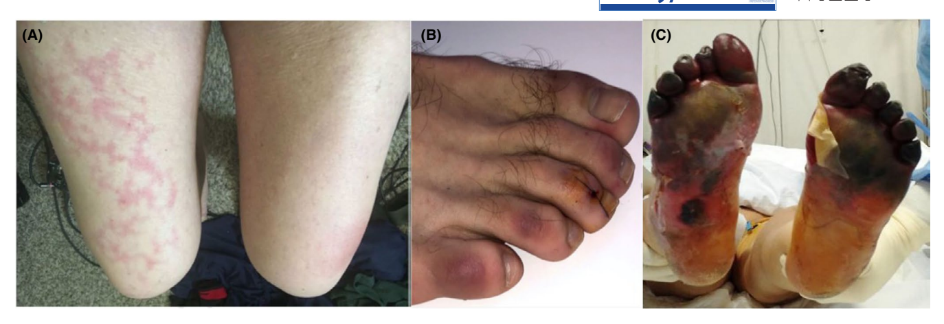
FIGURE 3 Skin manifestations associated with thrombovascular events and vascular pathologies. A, Transient unilateral livedo reticularis (erythema ab igne), <sup>34</sup> B, COVID-19-induced chilblains, <sup>35</sup> C, Acro-ischemia with cyanosis, skin bulla, and dry gangrene in critically ill patient <sup>38</sup>

manifestations. Necrotic lesions occurred in older and in severely ill patients with increased mortality.<sup>22</sup> Cutaneous acro-ischemic microthromboses and small blood vessel occlusion have to be further explored for their causality and specificity for COVID-19 manifestations.