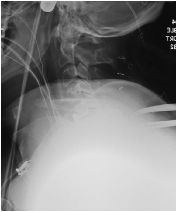
Figure 1 Intraoperative radiograph of the author's case had poor quality due to the patient's short and thick neck, thus leading to invisibility of cervicothoracic junction. Therefore, the authors relied on the C7 morphology, and initially instrumented the wrong levels because the patient had a bifid C7 spinous process.

(CT) imaging were enrolled in our study after Institutional Review Board approval. CT axial images of C6, C7, and T1 from those patients were evaluated by two spine surgeons (A and B: 20 years and 7 years postresidency, respectively). Amongst our patient population, 54 CTs were excluded because of congenital anomalies or prior surgery. Additionally, the tips of the spinous processes were not adequately visualized for all three vertebral levels in some cases, and these patients were also excluded.