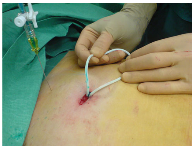
Fig. 2 Blue dye shows leakage of the tubing due to wear and tear on the fascia

Inaccessibility of the AP was seen in nine (1.5%) patients. This resulted in revisional surgery in six (1.0%)