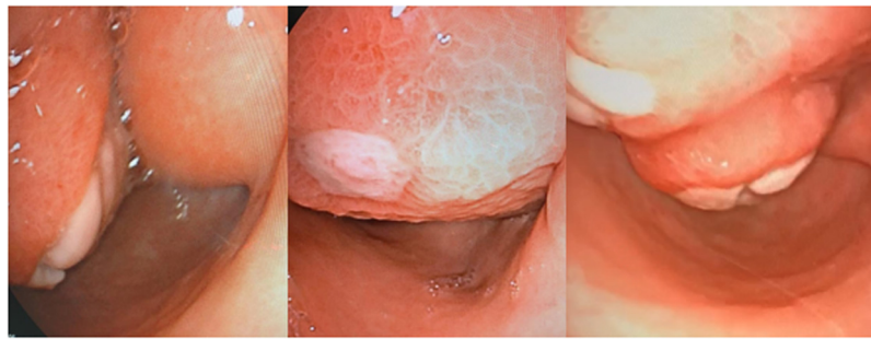
Fig. 1. Upper digestive endoscopy: gastric wall with subepithelial lesion with effect of intraluminal mass.