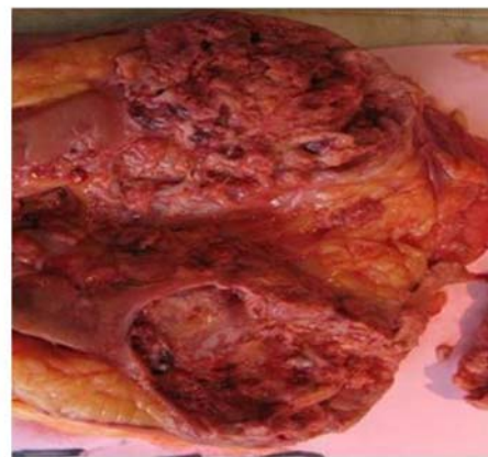
Figure 2 Partial nephrectomy specimen showing tumour in the upper pole.