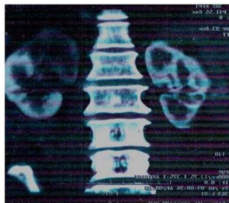
Figure 1 Abdominal CT-scan revealing left renal mass in the upper pole.

The patient was suspected clinically to have renal tuberculosis and was later found to have renal squamous cell carcinoma with possible lung secondaries.