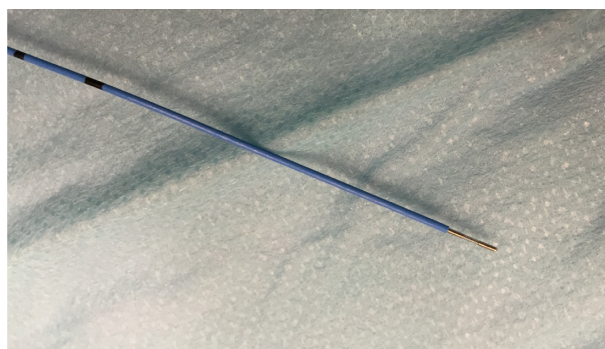
Figure 3 Catheter tip (Stimucath, Teleflex Germany, Kernen, Germany).

Finally, the specific wound metal tip (see Figure 3) might be more vulnerable to entangling with surrounding fascia structures (eg, prevertebral fascia, scalenus muscle fascia) compared with the smooth polyurethane tips on non-stimulating catheters. This might increase the risk of catheter separation with the application of gentle traction during removal. Interestingly, the majority of case reports with this catheter model deal with interscalene or supraclavicular nerve blockade. One might speculate as to whether this complication is seen more often in these locations or if it is due to the fact that interscalene catheter techniques are more common than continuous sciatic or femoral nerve blockades. On the