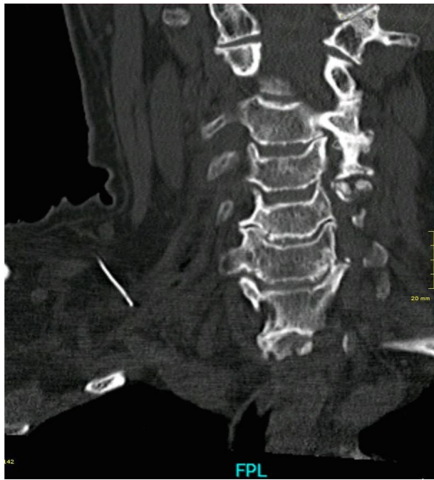
Figure 2 Computed tomography scan (frontal view) of residual metal wire.

After a thorough discussion of this topic with the orthopedic consultant, and within this framework, the patient gave consent for surgical removal by a neurosurgeon and an ENT surgeon who specializes in neck dissections, performed under general anesthesia. After the induction of general anesthesia and complete muscular relaxation in the afternoon, the ENT surgeon performed forceful traction again. The complete residual wire, including the complete characteristic steel wire tip, was successfully removed during this last attempt. Therefore, a surgical incision was not performed. After the termination of anesthesia, the patient had no neurological sequelae or pain at the insertion site or close to the plexus. She was discharged home on the following day.