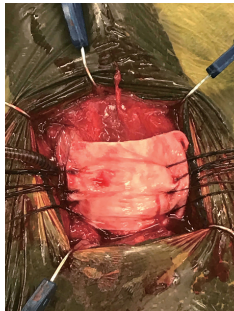
Figure 1: The graft is sutured to the medial aspect of each corporotomy (informed consent obtained).

Currently, the treatment option gaining popularity among prosthetic urologists for patients with climacturia and concomitant postprostatectomy ED is the Mini-Jupette graft. Originally described by Robert Andrienne in 2005 24 , the concept involves placing a graft across the urethra during IPP placement. The graft is sutured to the medial aspect of each corporotomy (Figure 1) and, as the cylinders expand during inflation, the graft applies tension on the urethra (Figure 2), thus limiting climacturia. Yafi et al. 29 reported the results of a prospective, multi-institutional study of patients with post-RP ED and climacturia and/or mild SUI (defined as <2 pads per day) who underwent IPP insertion with concomitant placement of a Mini-Jupette graft. Data were collected for procedures performed at 17 centers in the United States, France, Belgium, Germany, and Korea by high-volume IPP implanters (>50 per year). Thirty-eight patients with postprostatectomy ED, climacturia, and/or mild urinary incontinence (defined as no more than two pads per day) were